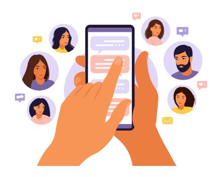
Followers of FAMOUS INFLUENCERS will buy Believer Coins