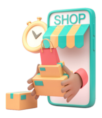
You can use Believer Coins in stores that are owned by followers