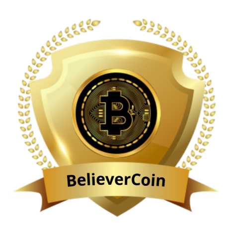
This creates our own Ecosystem, that is safe from others

In a crisis this guaranteed money will maintain it`s value